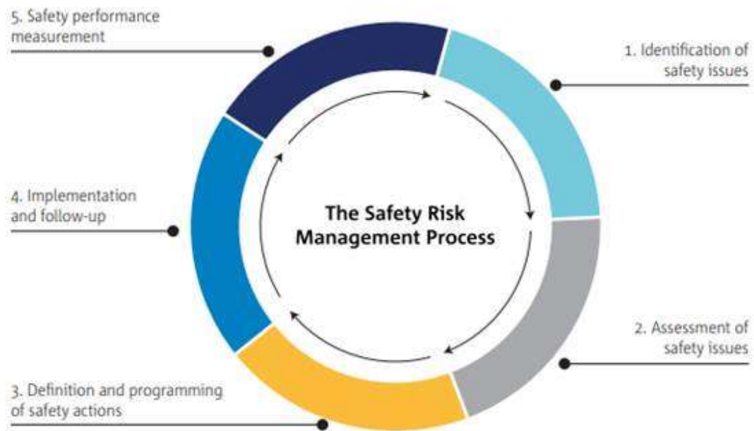
Figure 2. Expanded Deming cycle